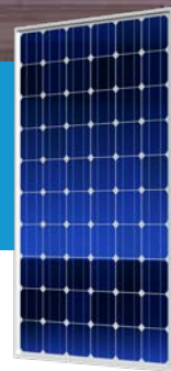
8x370w Mono Crystalline Solar Panels