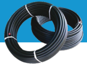
20m DC Power Cable & Isolator