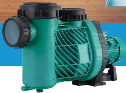
1.5kW Pool Pump & MPPT Controller