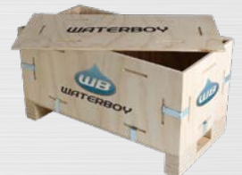
Shipping Dimensions 1x Crate 440 x 60 x 65cm @ 280kg 1x Pallet 200 x 115 x 45cm @ 190kg