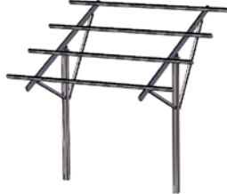
Heavy Duty Cyclone Rated Pole Mount Frame