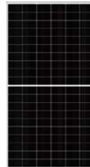
8x450w Mono Crystalline Solar Panels