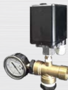
Pressure Switch 12 bar inc gauge & fittings $300+GST