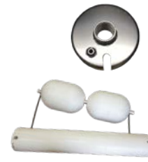
Bore Cap or Dam Float