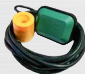
Tank full switch inc 20m cable $165+GST