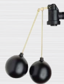
Double acting float valve For use with Pressure Switch - $300+GST