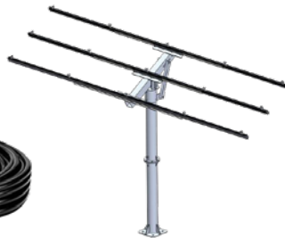
Heavy Duty Cyclone Rated Pole Mount Frame