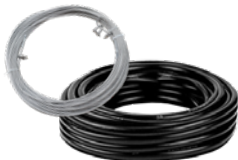
40m of Power Cable low water probe & safety cabling