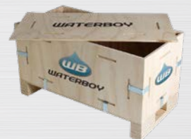
Shipping Dimensions 1x Crate 175 x 55 x 65cm @ 125kg